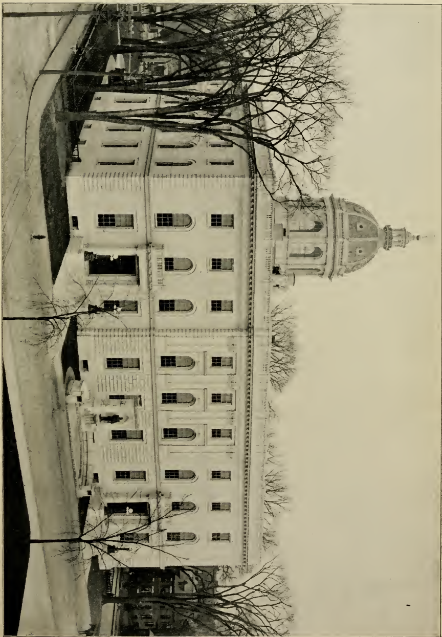
STATE HOUSE, Rear.