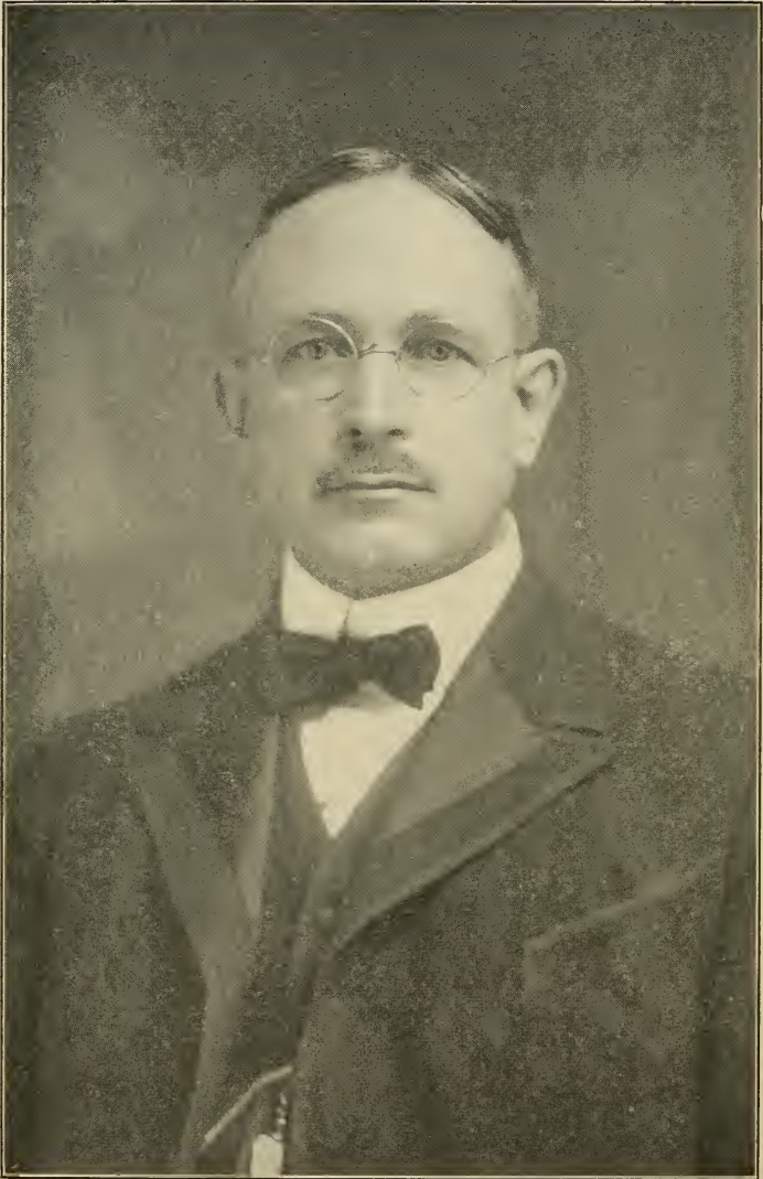
Governor JOHN H. BARTLETT