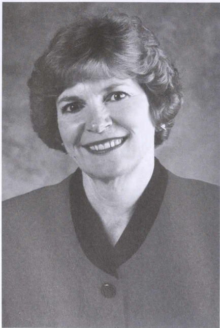
Governor JEANNE SHAHEEN