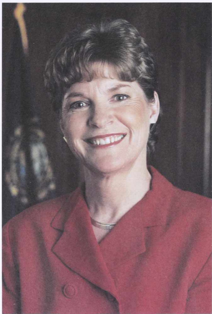
Governor JEANNE SHAHEEN